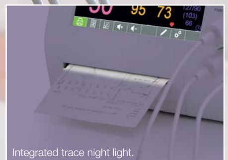
Integrated trace night light.