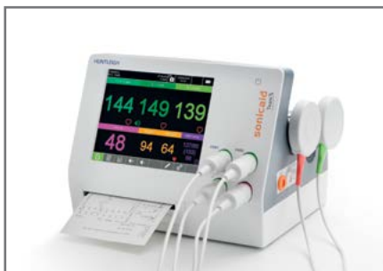
TEAM3 - A/P

TREND intrapartum function provides clear data on periodic changes over time in the FHR. For use during the first stage of labour. Trending of baseline, STV and deceleration data provides an aid to labour trace interpretation.