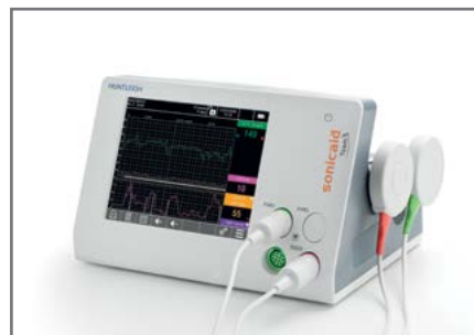
TEAM3 - e-CTG

Paperless monitoring option with no printer. (PC & software required)