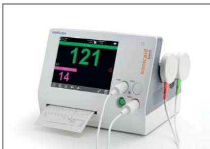
TEAM3 - I/P

Antepartum and Intrapartum models available in singleton, twins or triplet configuration. Available with maternal vital signs and integral battery options.